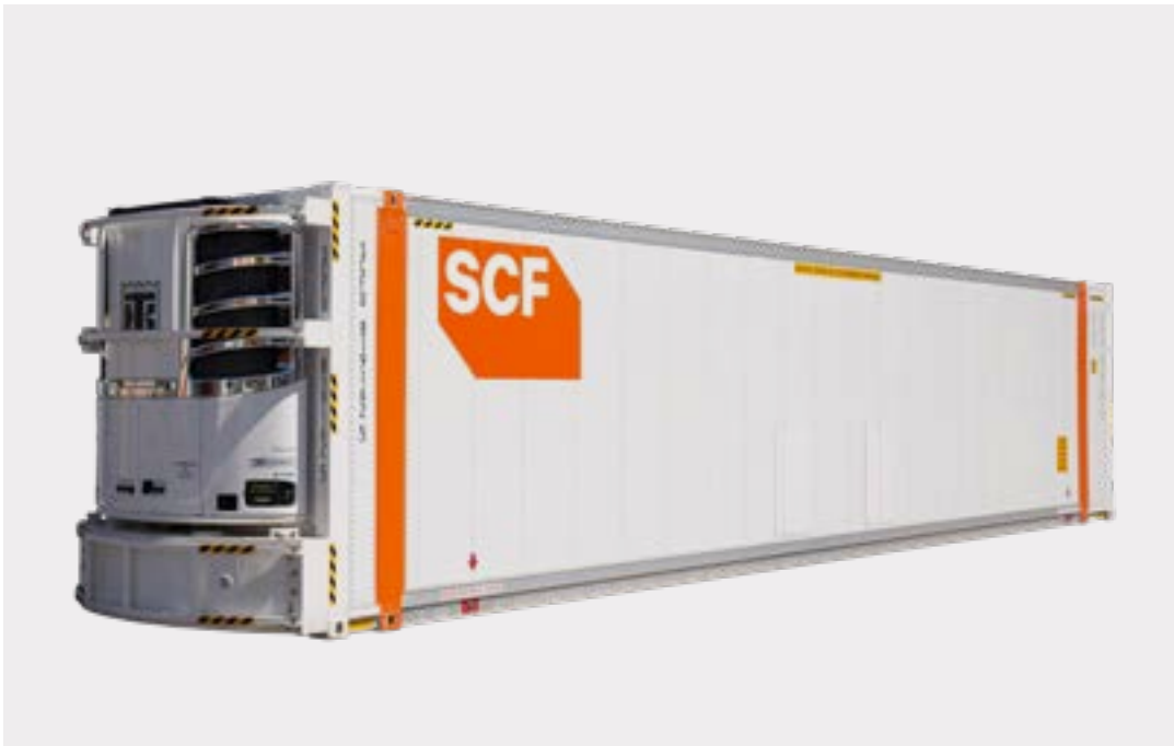
Top: Store up to 22 pallets in a temperature controlled container.