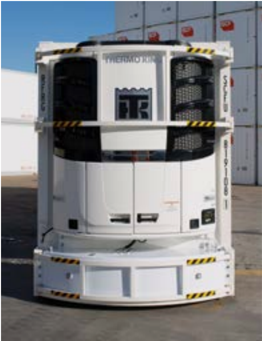
Middle Right: Easy to operate - set and forget.